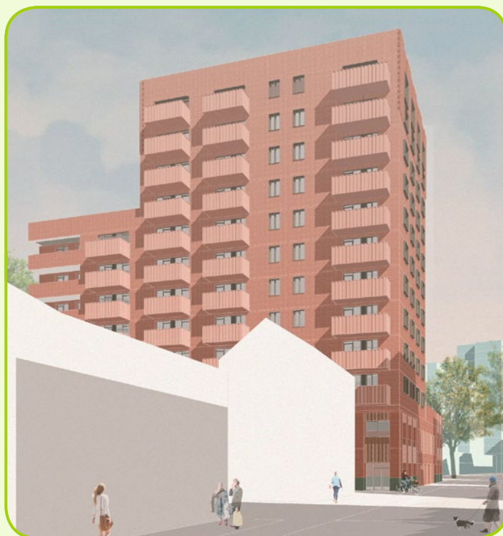
An artist's impression of how the scheme may look

As part of this work a planning application is being submitted this autumn for land in South Grove, Walthamstow which has previously been occupied by four industrial units and is known as Site C in the St James' Quarter.