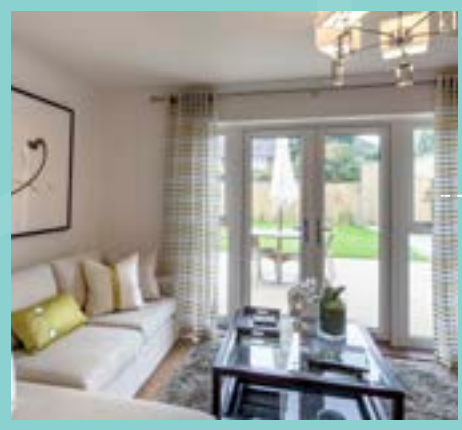
{ Claude Terrace - London & Quadrant/PRP }