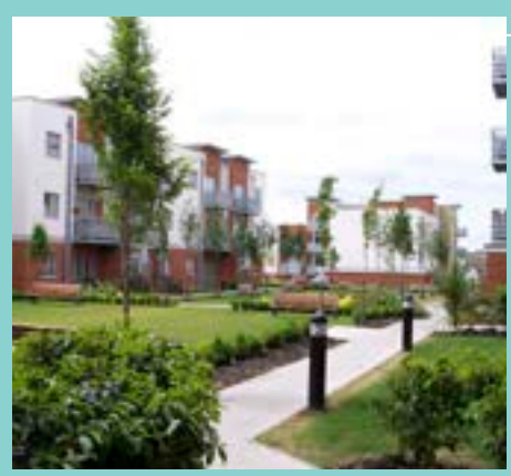
{ Hawker Place - Barratt Homes/M F Jewell }