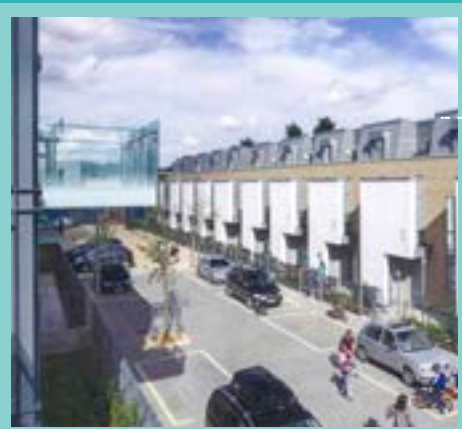
{ Highams Green - Spenhill/Collado Collins }