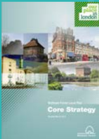
Waltham Forest Core Strategy