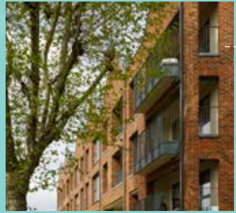
{ Hammond Court - East Thames/Mae }