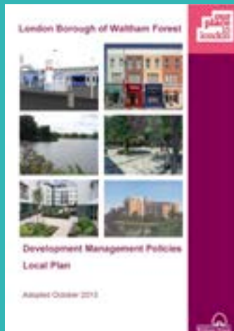
Waltham Forest Development Management Policies