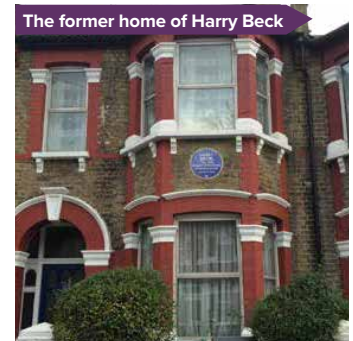
The former home of Harry Beck

It's quite right that we started at a Transport for London Station. Henry Charles Beck (1902-1974) was born at 14 Wesley Road. Harry was a draughtsman for London Underground Signals Office. In his spare time, he drew a map of the underground network and presented it to his bosses in 1931. Unfortunately, it wasn't immediately popular and not until after a successful trial in 1932 was it promoted by London Underground the following year.