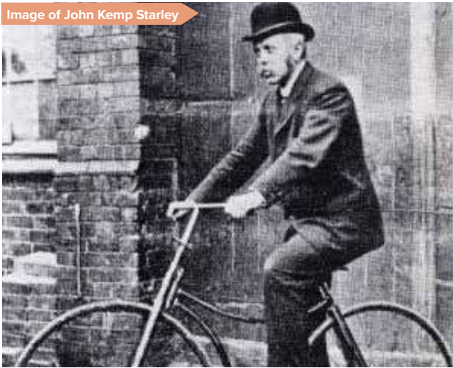
Image of John Kemp Starley

Soon After John’s death in 1901 the Rover group began manufacturing motorcycles, then cars and grew into the successful Rover Group making other British global brands such as the Land Rover.