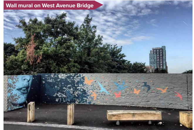
Wall mural on West Avenue Bridge