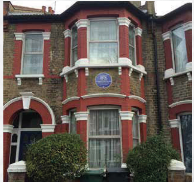
■ The former home of Harry Beck

Unfortunately it wasn't immediately popular and not until after a successful trial in 1932 was it promoted by London Underground the following year.