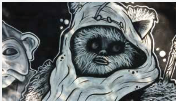
Star Wars Mural