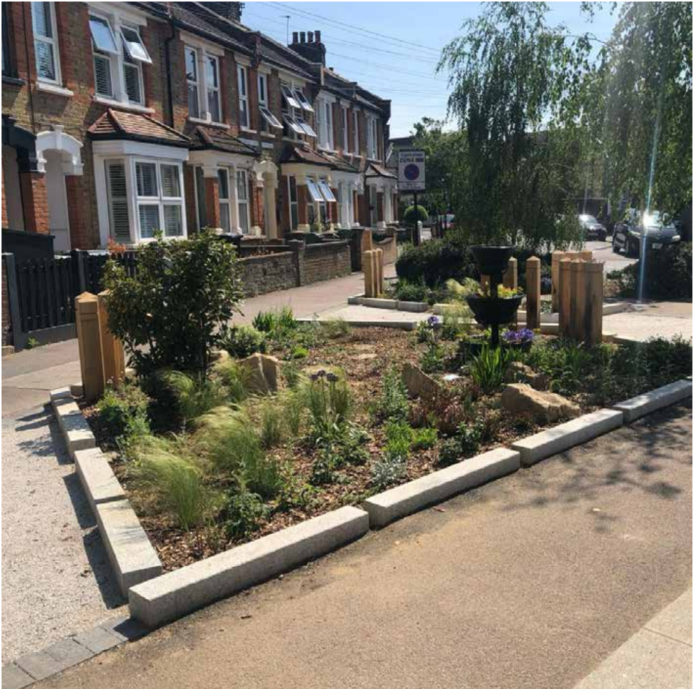
Example of a rain garden