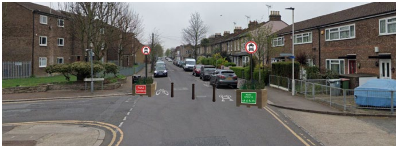
Indicative location of one of the modal filters on Odessa Rd, looking north towards Waltham Forest.