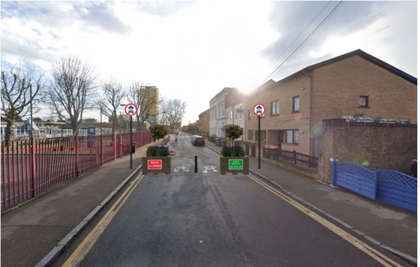
Indicative location of the modal filter on Maryland Rd, next to Colegrave Primary School.