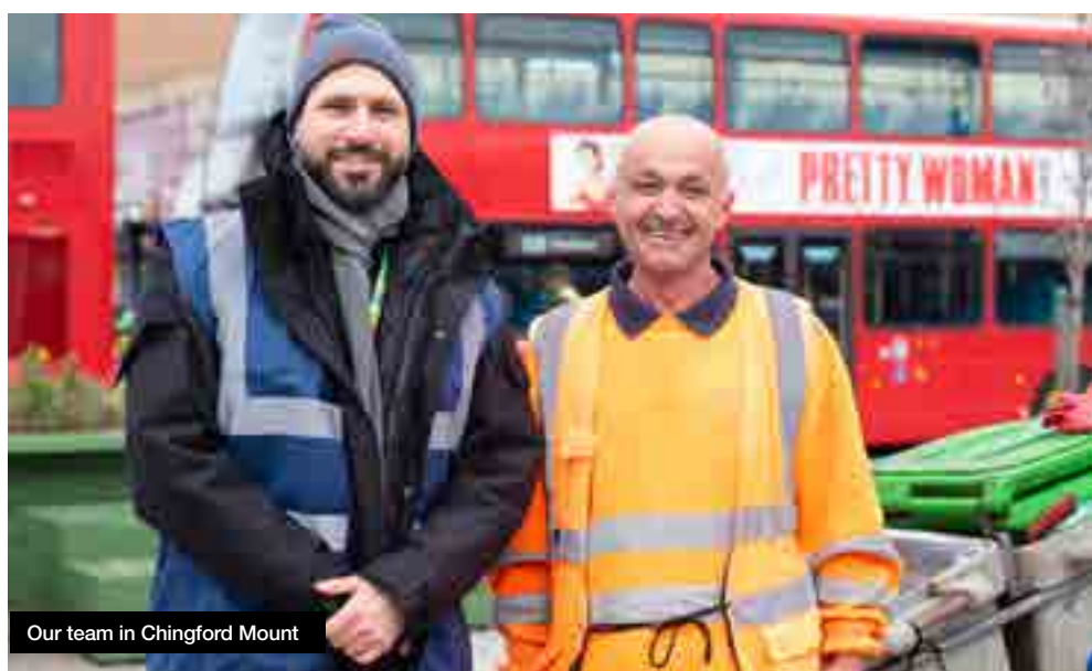
Our team in Chingford Mount