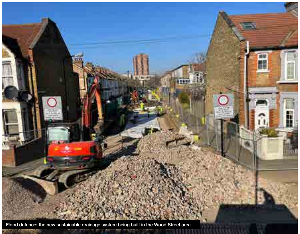
Flood defence: the new sustainable drainage system being built in the Wood Street area