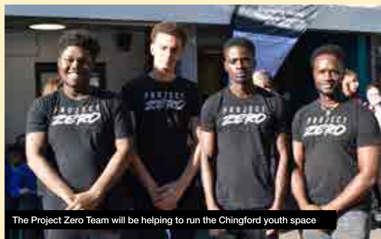
The Project Zero Team will be helping to run the Chingford youth space

We’re pleased to be working in partnership with local voluntary and community organisations to pilot these spaces. Watch this space for more new spaces in the coming months.