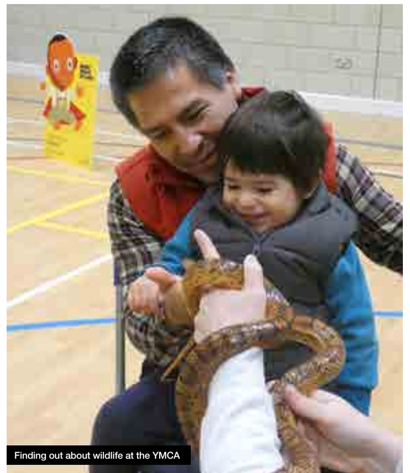
Finding out about wildlife at the YMCA