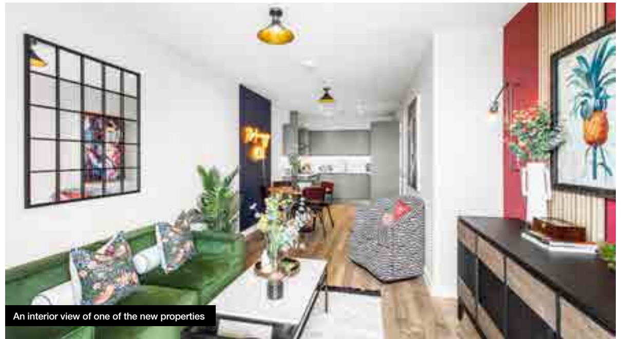
An interior view of one of the new properties

The chance of owning your own home is often considered a step too far for many who are living in London.