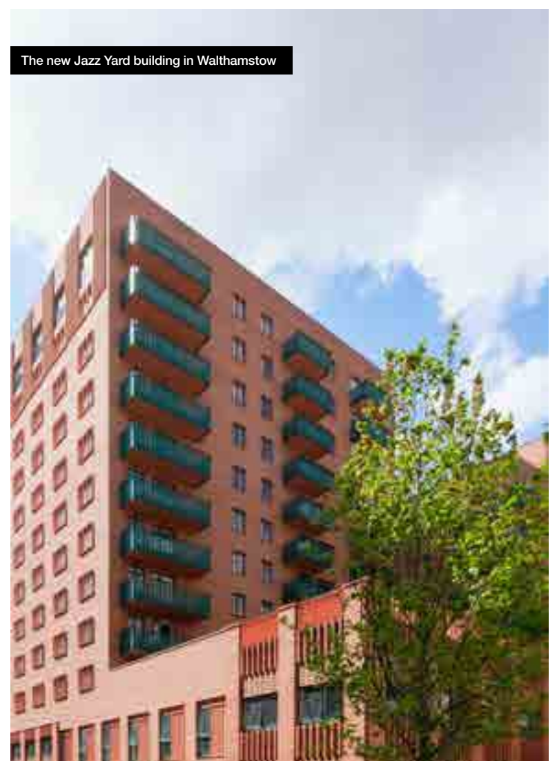
The new Jazz Yard building in Walthamstow

“And once you've chosen your prospective new home, keep in touch with the agent and keep asking questions. At the end of the day, it's still a sizeable investment and you have to be very comfortable with your decision and have all the information you need.”