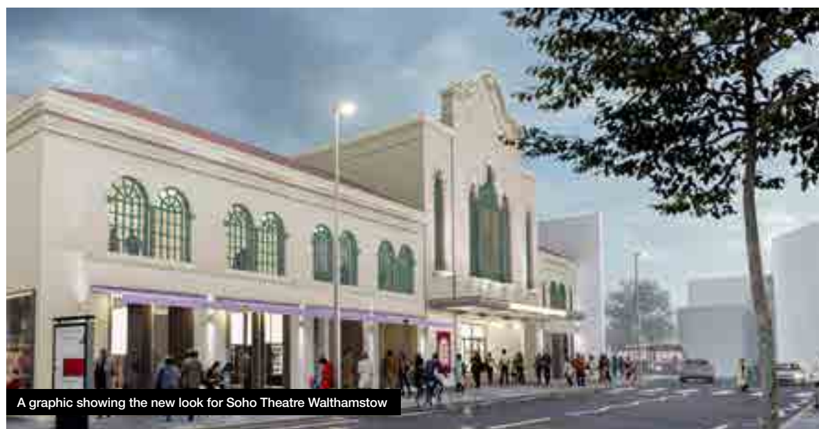
A graphic showing the new look for Soho Theatre Walthamstow