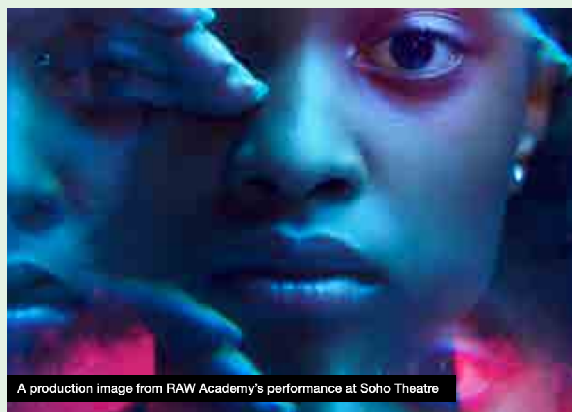
A production image from RAW Academy's performance at Soho Theatre

Find out more about their activities at sohotheatre.com/walthamstow