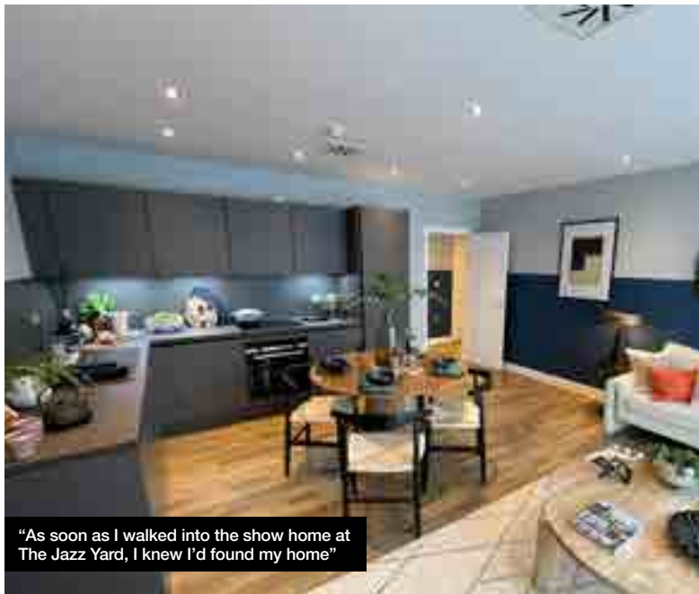
“As soon as I walked into the show home at The Jazz Yard, I knew I'd found my home”

“When I walked through the door, it was everything I'd been looking for”