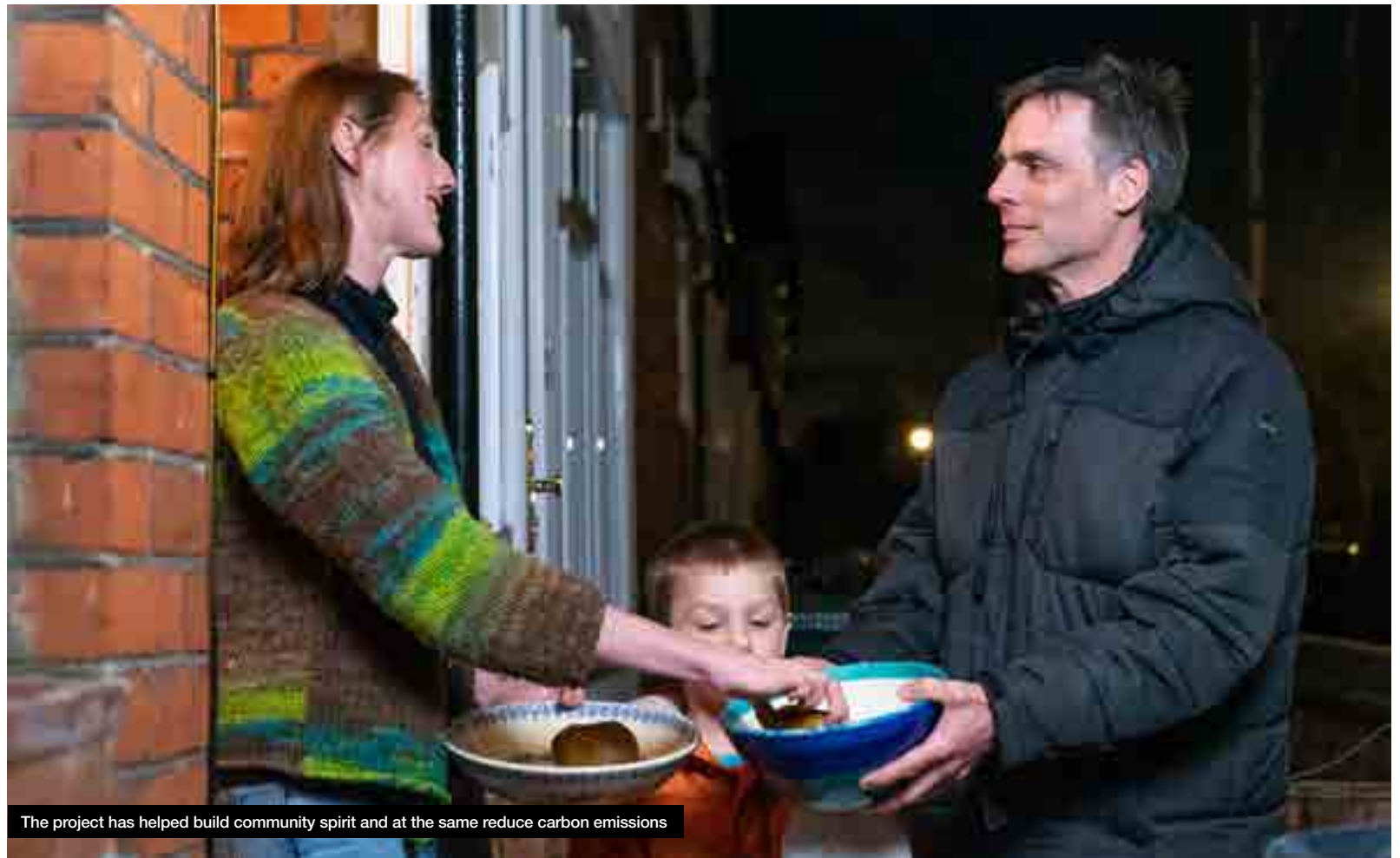
The project has helped build community spirit and at the same reduce carbon emissions