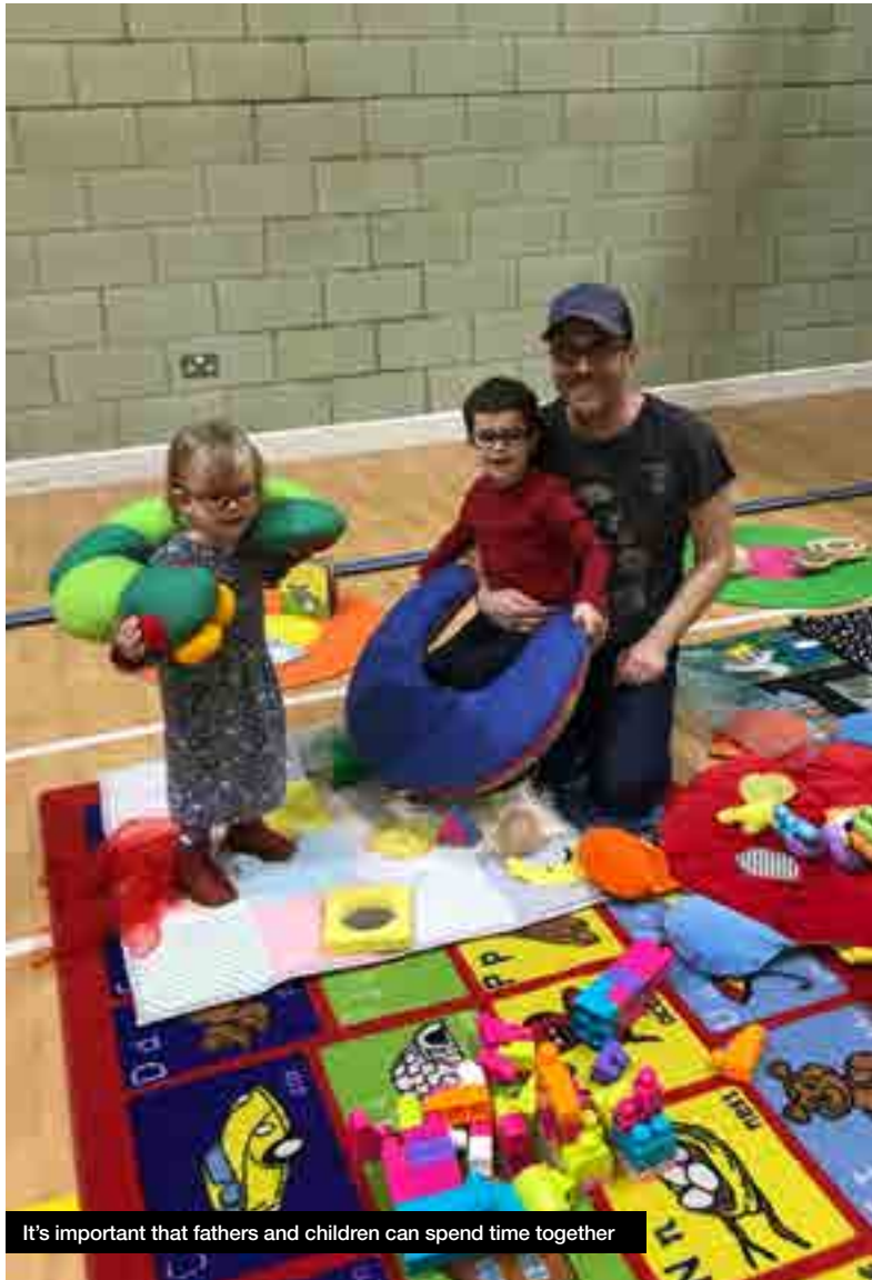
It's important that fathers and children can spend time together

How we're helping children in Waltham Forest get the Best Start in Life