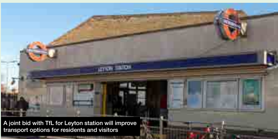
A joint bid with TfL for Leyton station will improve transport options for residents and visitors

“The step-free access is especially valuable for those with mobility issues who should be able to enjoy all that our brilliant city offers easily and without needless difficulty.”