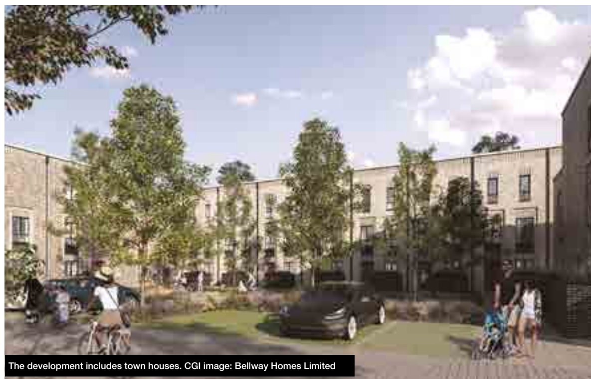
The development includes town houses. CGI image: Bellway Homes Limited