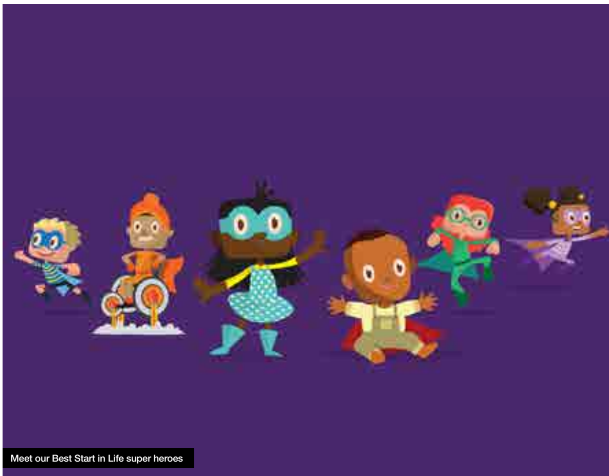
Meet our Best Start in Life super heroes

All parents, carers and families are welcome at Waltham Forest hubs. Find your local Family Hub and learn more about the local support for your child to get the best start in life at walthamforest.gov.uk/beststartinlife