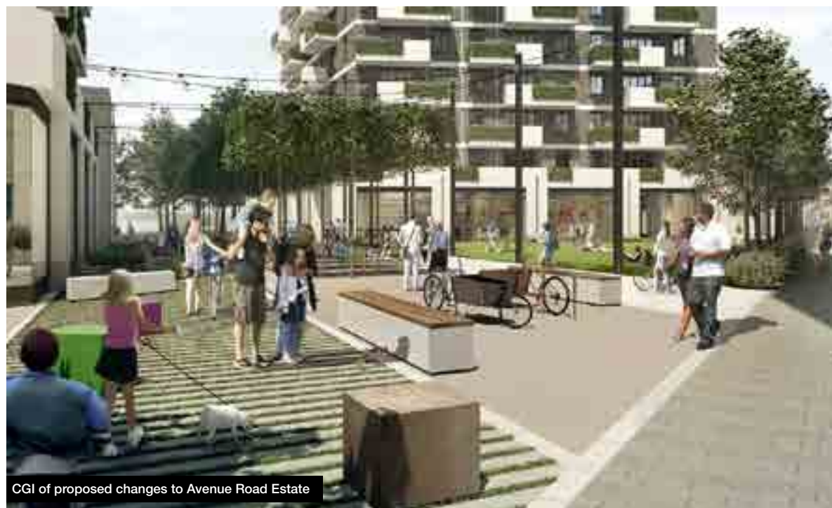
CGI of proposed changes to Avenue Road Estate

The plans also provide many other benefits for the wider community and improves connectivity to local services, as well as creating new local jobs and apprenticeships for local people during and after the construction work.”