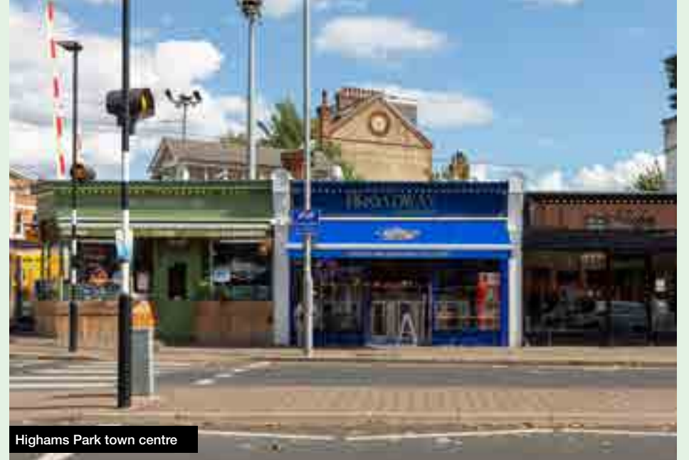
Highams Park town centre

Chingford Mount town centre will see improvements to make the area safer and more inclusive, particularly for young people, who will be involved in the design process.