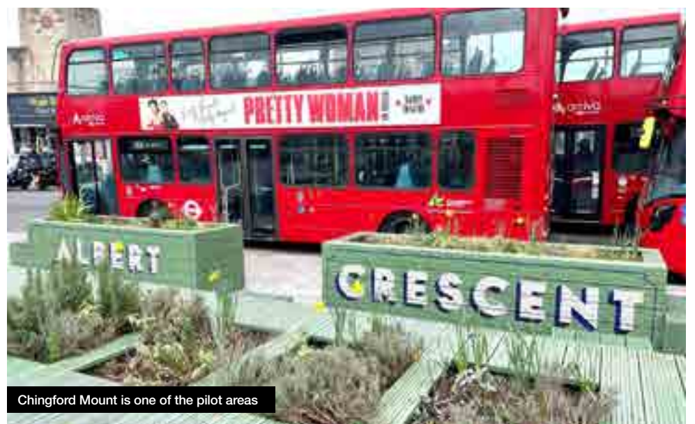
Chingford Mount is one of the pilot areas