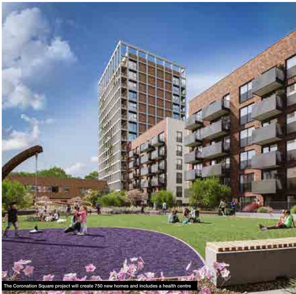
The Coronation Square project will create 750 new homes and includes a health centre

More info Find out more at bit.ly/LBWFCapital