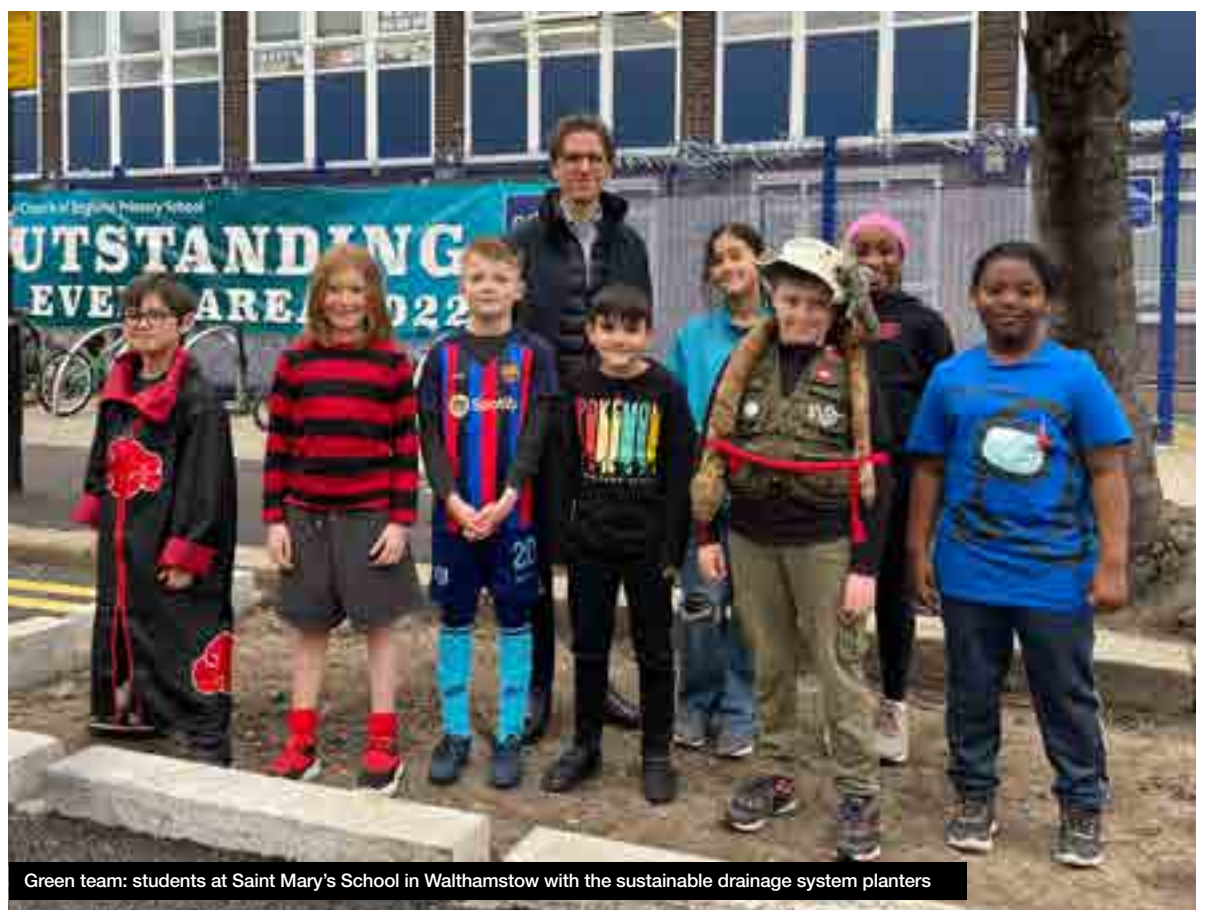
Green team: students at Saint Mary's School in Walthamstow with the sustainable drainage system planters