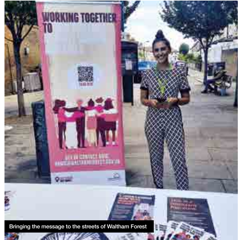
Bringing the message to the streets of Waltham Forest