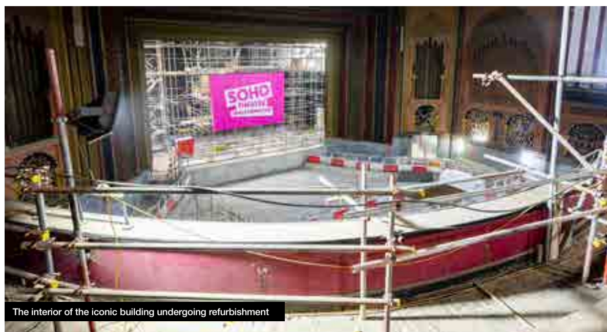
The interior of the iconic building undergoing refurbishment

To get the latest updates, sign up to our newsletter at walthamforest.gov.uk/soho