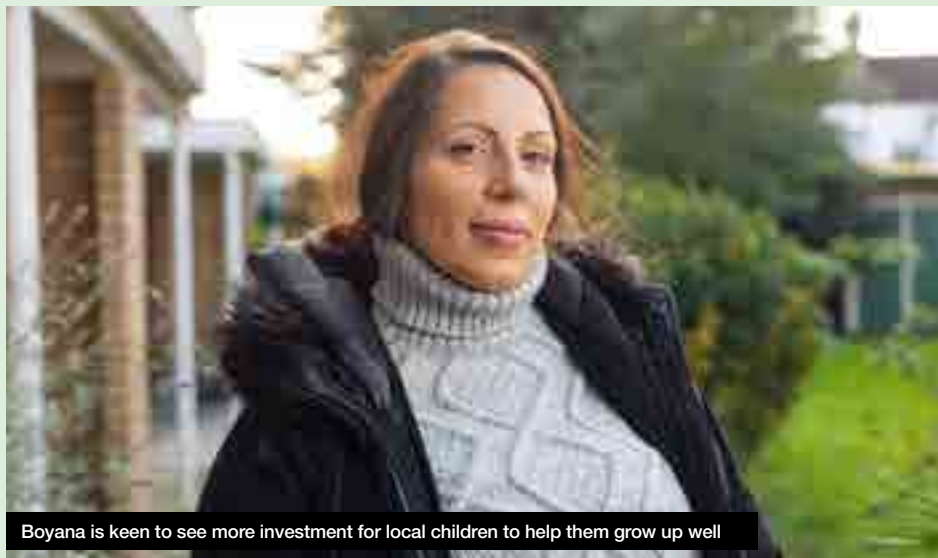
Boyana is keen to see more investment for local children to help them grow up well

You can read more about the new approach in this issue of your Waltham Forest News, or visit bit.ly/WFNeighbourhoods