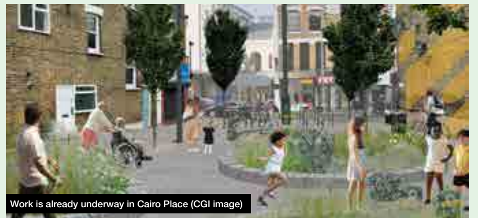
Work is already underway in Cairo Place (CGI image)