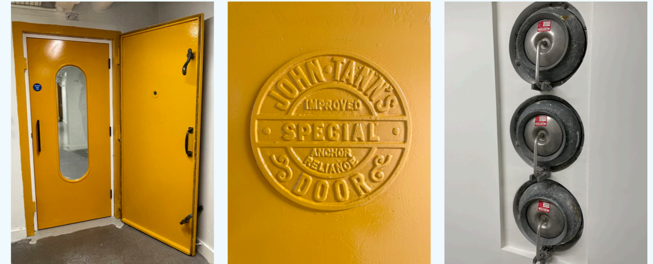
Below: The Town Hall basement which retains its steel airtight doors.

The outbreak of the Second World War in 1939 impacted on the progress of the construction work. Internal finishes had to be significantly simplified, which led to an increased use of colour effects by painting. Some of the fixtures and fittings had utilised alternative materials, for example plywood was used in the committee rooms instead of oak, Terazzo tiles were used in the foyer rather than marble and in the Council Chamber the Victorian furnishings, with the initials WDC for Walthamstow District Council (1894–1929) from the old Town Hall were reused instead of commissioning new furniture with initials WBC Walthamstow Borough Council (1929–1965). The external Portland stone was going to be replaced by brick, but in the end it was possible to use the original material. Even though building work wasn't complete, the Town Hall became the Civil Defence Head Quarters during the war and was used by the ARP (Air Raid Precautions) wardens. The Western end of the basement consists of a windowless bunker and retains its steel airtight doors. Within the walls there remain the explosive protection valves to protect against bomb blasts. The fortified basement later became a Cold War Shelter.