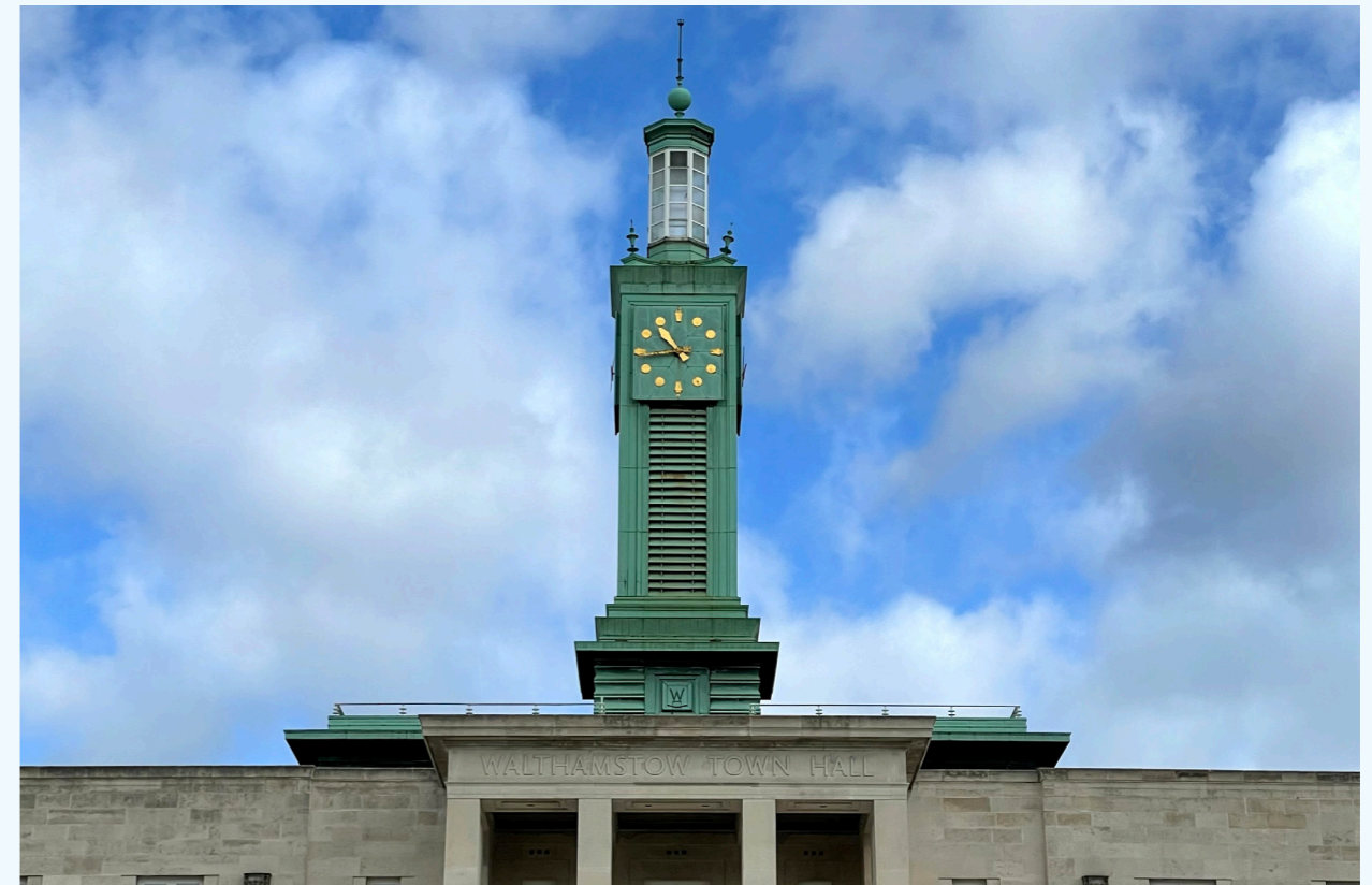
Above: The Clock Tower on Waltham Forest Town Hall.