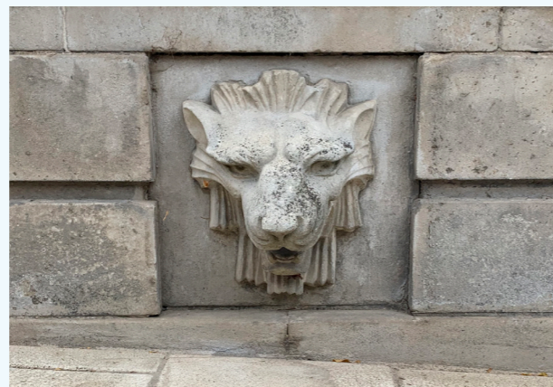
Above: A lion adornment found on the side of the Town Hall.

Amity is based on the two lion head sculptures on either side of the Town Hall building. Sculptures of lion heads are among the most popular decorative adornments of buildings across England. The lion represents the qualities of bravery, valour, nobility, strength, fierceness and gravitas. In architectural sculpture the lion head can serve several purposes: as decorative sculpture on a grand building, to indicate a principal entrance or centre to a building, or to indicate Britishness, as in a civic building or bank or other building put up for an organisation wishing to have connotations of patriotic feeling. Our lion character has been given the name Amity, meaning 'friendship', to echo the name and ethos of Fellowship Square.