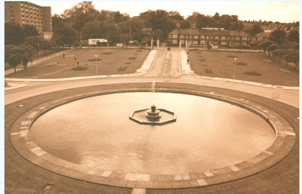
Above: The fountain which was added in 1953 to commemorate the coronation of Queen Elizabeth II.

The Fellowship Fountain is at the centre of Fellowship Square. It is a space for everyone to enjoy, it is safe and accessible for all residents and visitors. The new fountain retains the original vision as imagined by Philip Hepworth. There is a central plinth with a feature central jet. In addition, there are 144 individual jets, with multi-coloured lighting to illuminate the space which can be set to match Town Hall façade lighting. The jets can also be programmed to dance to music, bringing the whole space to life.