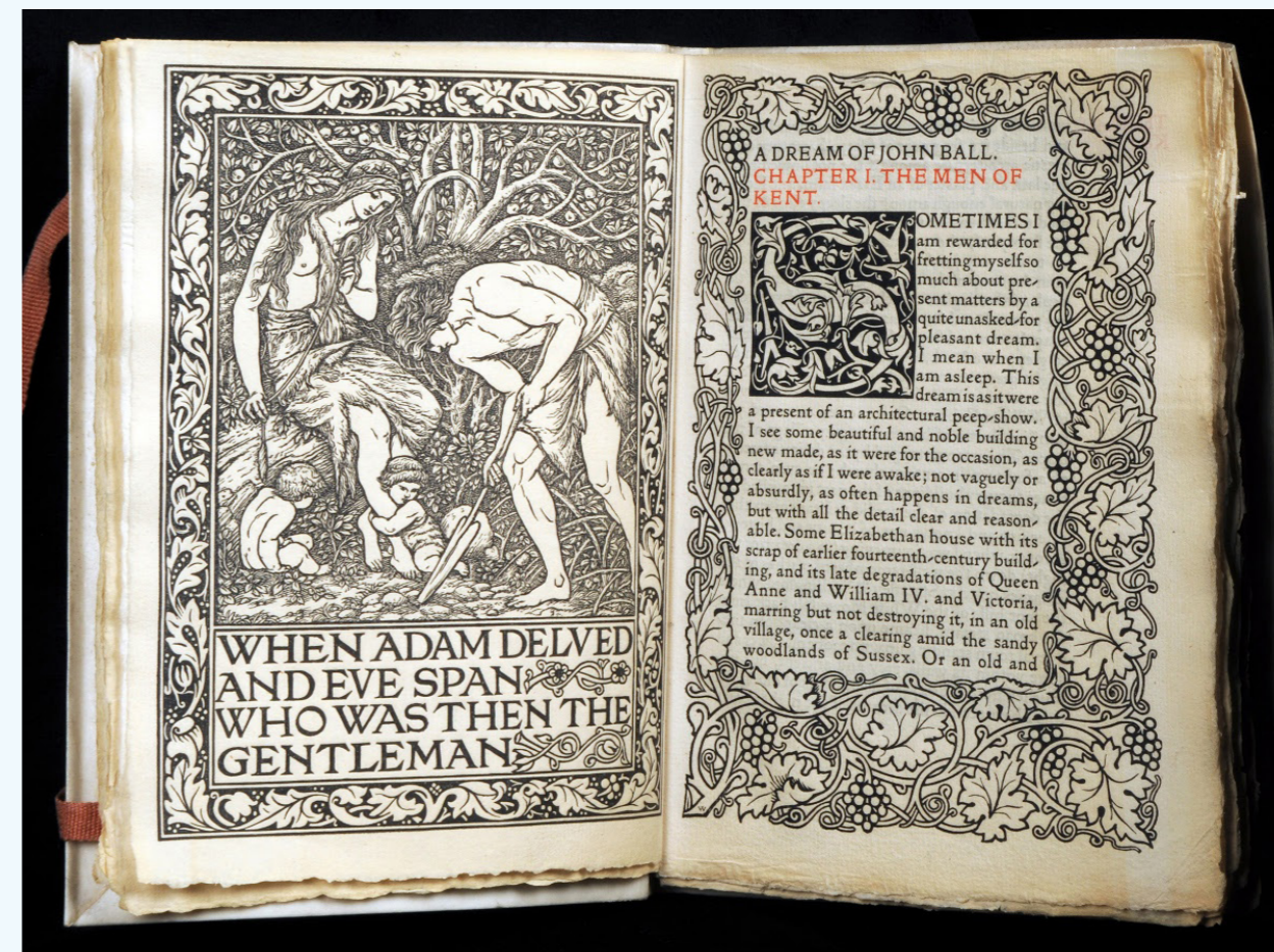
Above: A Dream of John Ball which features the William Morris quote: Fellowship is Life, Lack of Fellowship is death.

Carved on the front of the Assembly Hall is a William Morris quote, Fellowship is life, lack of fellowship is death.