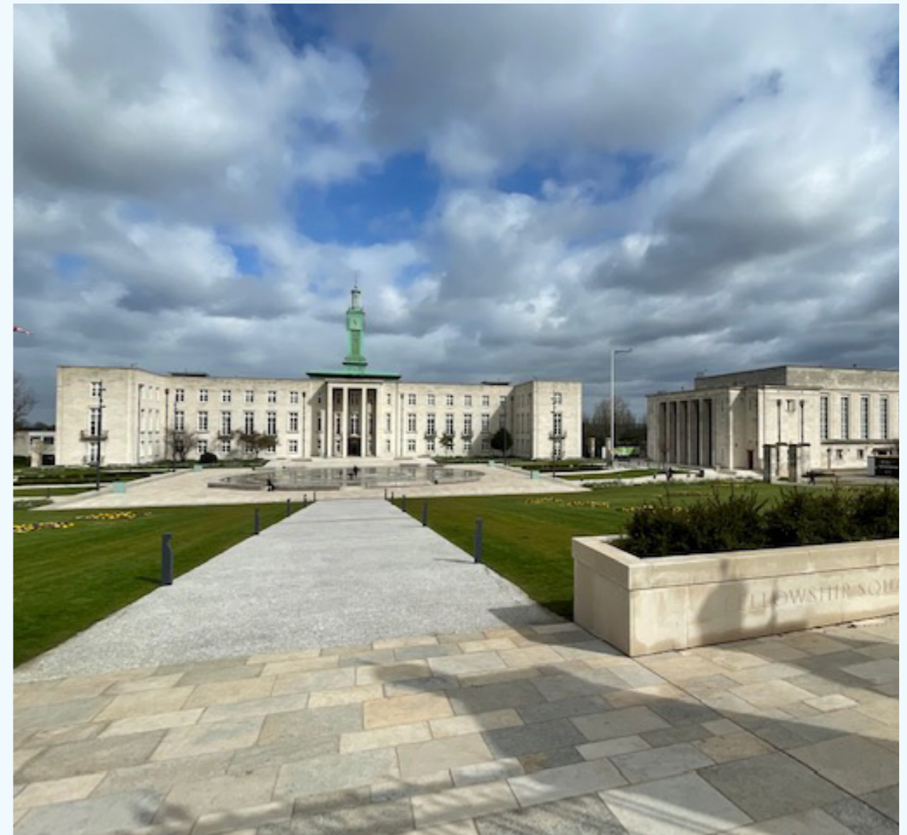
Above: The Town Hall building as viewed from the main gates.

Whilst these gender-role stereotypes might have reflected society at the time, they are not representative of modern Waltham Forest.