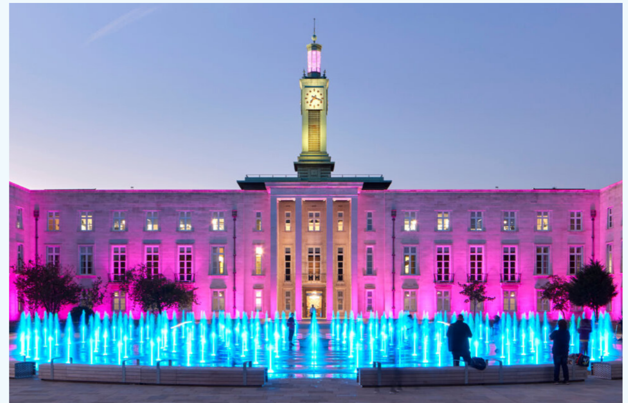
Above: Fellowship Square in 2022 with its new fountain with 144 illuminated jets.