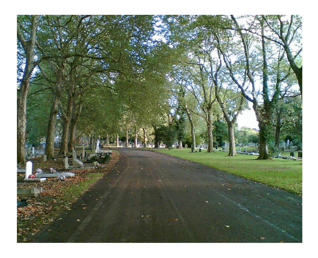
Chingford Mount Cemetery, 121 Old Church Road, Chingford, London E4 6ST