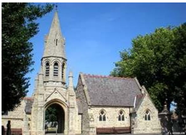
Queens Road Cemetery, Queens Road, Walthamstow, London E17 8QP