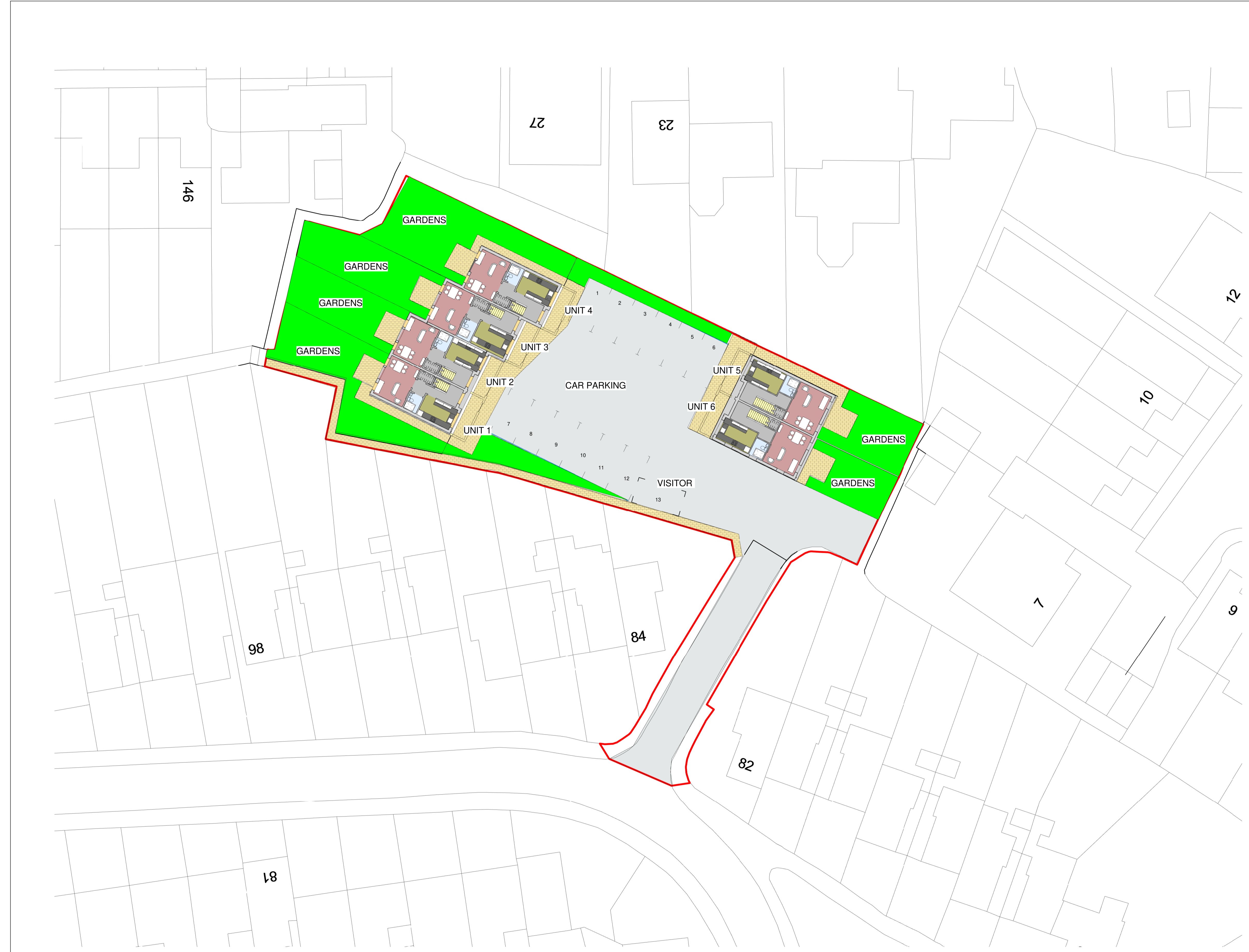
Site Section 105