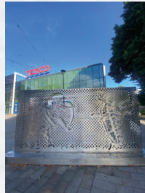
Elephant & The Tortoise steel sculpture

Outside Tesco you will see the Elephant & The Tortoise steel sculpture standing 4x2m tall commemorating the British Xylonite Halex Factory which stood on this exact site in Highams Park between 1897 and 1971. One of their original trademarks was an etching of an elephant and tortoise walking arm in arm, which the artist used as inspiration for the sculpture. The factory was famous for its production of Xylonite, the first artificially made commercial plastic. They famously manufactured table tennis balls and other items such as combs, toothbrushes, cutlery, and boxes and became one of the largest employers in Waltham Forest.