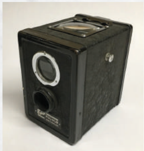
Ensign Ful-Vue box camera.

From 1908 to 1954, Ensign Camera Factory (known as 'Ensign Works') operated from Fulbourne Road, Walthamstow. By 1949, the company employed around 900 people and claimed to be the biggest camera manufacturers in Europe. In 1939 they introduced the English Ful-Vue box camera, one of the most popular cameras of its time in the UK. The factory was eventually destroyed by enemy bombing during WWII on 24 & 25 September 1940. On the opposite side of the road, the ASEA & Fuller Electric factory stood where ASEA (Great Britain) Ltd and Fuller Electric Ltd manufactured electric motors and transformers from 1919.