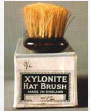
British Xylonite hat brush.