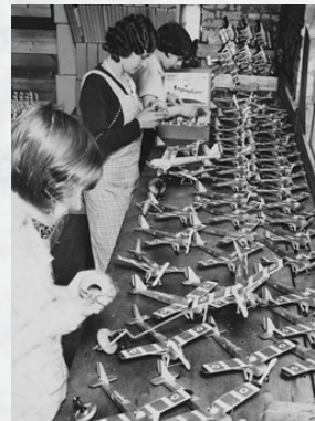
Factory workers in Britains Toy Factory.

Next, visit Sutherland House which possess a rich history. Britains Toys Ltd was founded by William Britain Jr in 1907. Britains Toys originally operated in Walthamstow from the North Light Building on Stirling Road where they manufactured lead model soldiers and farm and country village sets. Their success led to the purpose-built Sutherland House, which they relocated to in 1958. Sutherland House provided employment in Walthamstow for over 750 people in its premises and a further 3,000 home workers. Today, Sutherland House operates as a business centre, providing affordable office space, workshops, and studios to the local community.