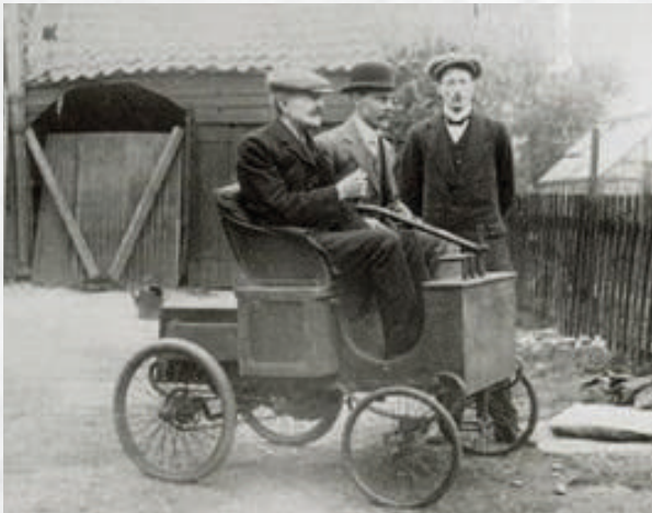
Bremer Car.

To get there, head south on Sutherland Road and take a right onto Higham Street followed by a right onto Higham Hill Road. Then turn right onto Forest Road until you reach Fellowship Square (Waltham Forest Town Hall) and take a right onto Hurst Road. Continue straight onto The Drive and then stroll through St Mary's Church active travel corridor until you reach Vestry Road where you will reach your final stop!