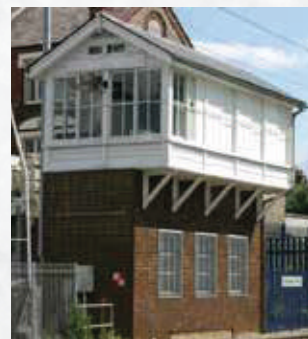
Higham Park Signal Box

Once you've had a look at where Sir George was born you can have a look around the shops and places to eat on Hale End Road or head to Highams Park station via the Avenue for services to Liverpool Street, Walthamstow and Chingford.