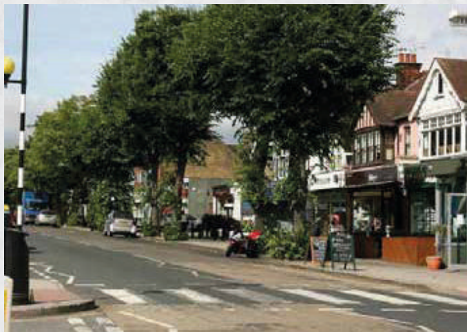
■ Station Road, Chingford