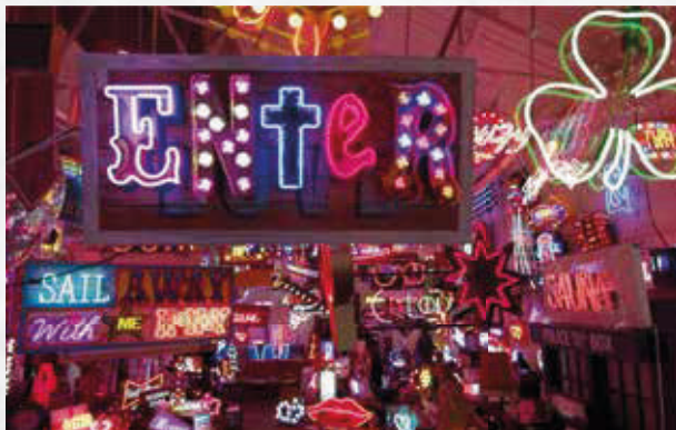
■ Gods Own Junk Yard