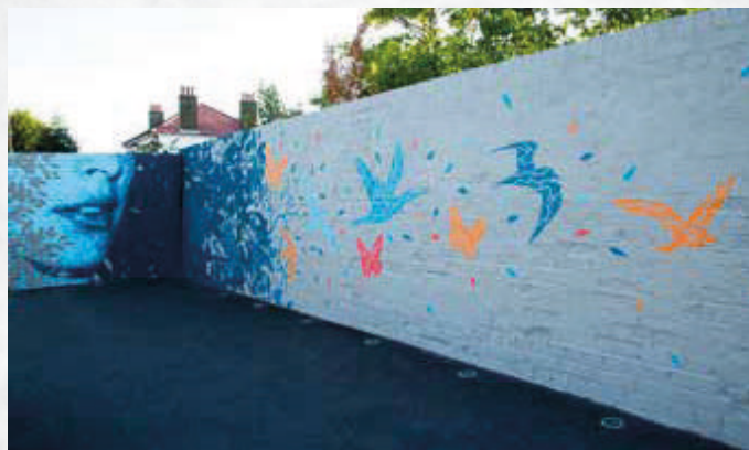
Wall mural on West Avenue Bridge, by Wood Street Walls