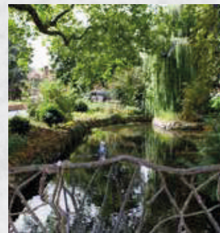
■ Lloyd Park