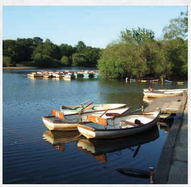
Hollow Ponds, Leytonstone