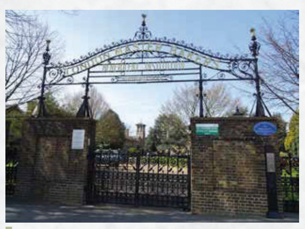
Bakers Alms House